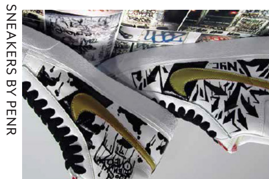
SNEAKERS BY PENR